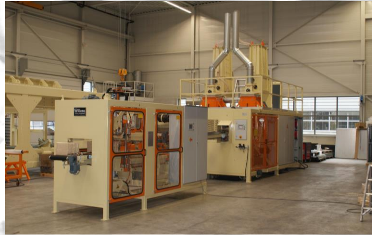
Baler and bundling machine