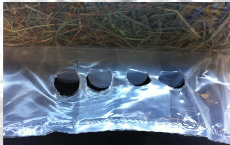
Handgrip on top side of the bale.